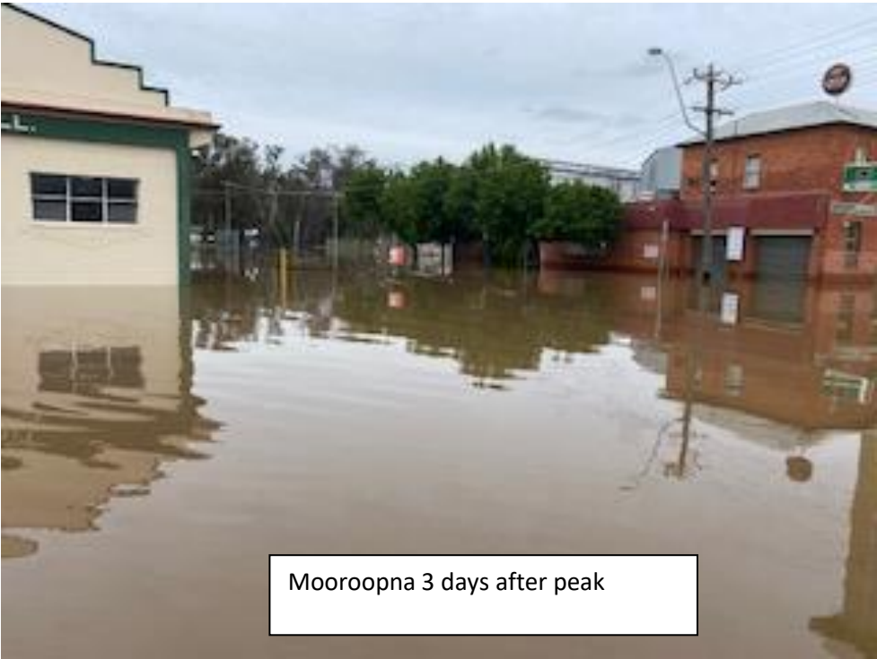
Mooroopna 3 days after peak