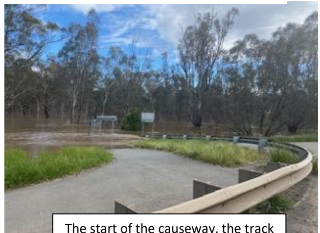
The start of the causeway, the track to Mooroopna