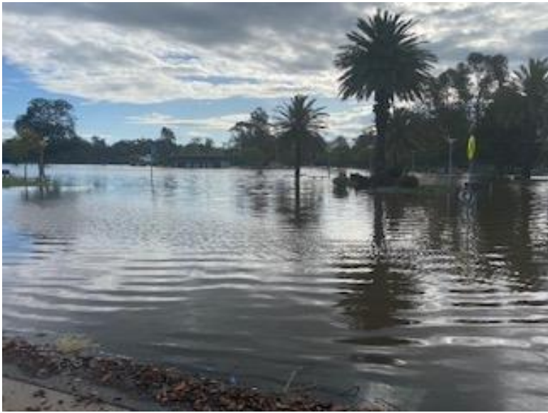
The lake, water over Wyndam, street