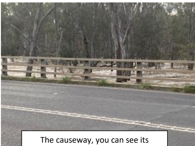
The causeway, you can see its almost on the road in this area, it did cover towards Mooroopna.