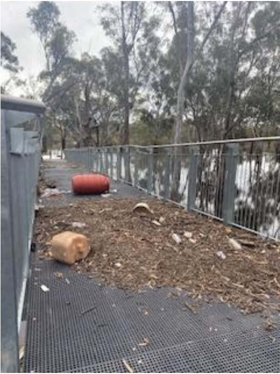
Bridge showing how high the water rose at the botanic gardens